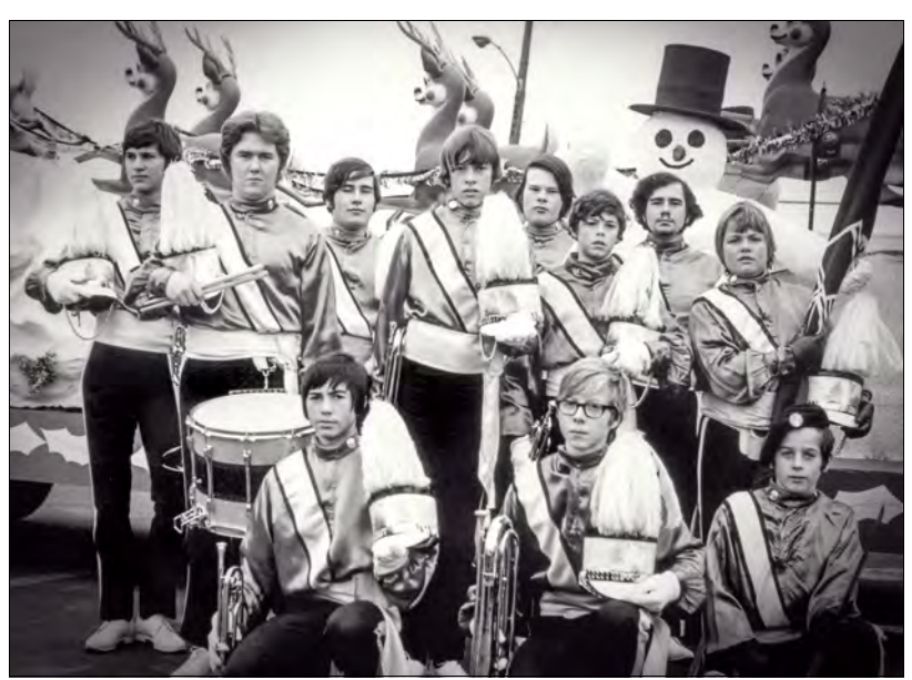
1970: Some corps members after a Christmas parade

Closer to home, the Optimists announced the scrapping of their triple drums in favour of tympanis. The Nationals general effect score may have had something to do with this. Also, it was a conforming to trends that had begun during the sixties.