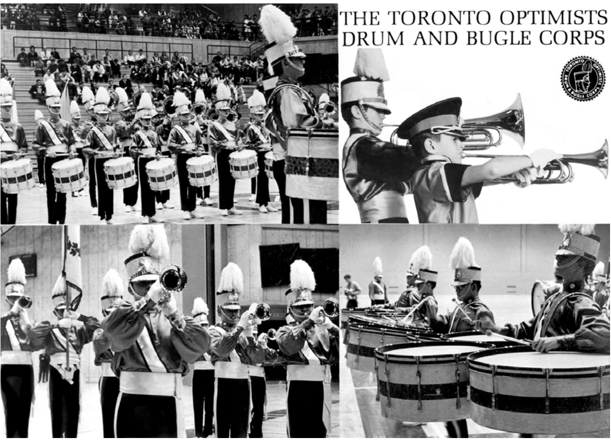
1970: Toronto Optimists Montage by Randy Cochrane

How have the mighty fallen. Would things stay that way? We shall see.