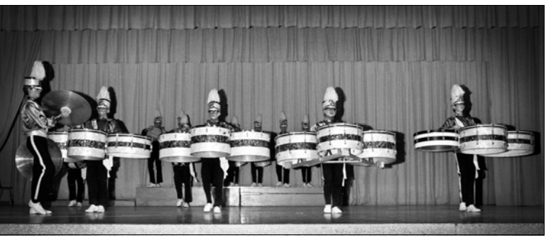
1970: Toronto Optimists triple-bass (indoor show)

Overall, the rise of the juniors surpassed that of the seniors. Organizational changes in Junior Corps would soon alter the scene much more. The fastest rise in Canada had to be the La Salle Cadets, who in less than three years had almost won the Nationals. The days when a Corps could do it in one season were