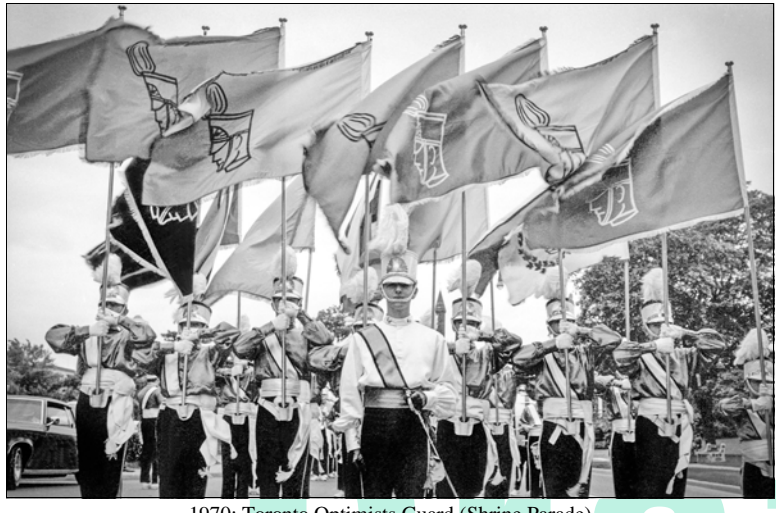
1970: Toronto Optimists Guard (Shrine Parade)

more evident. Their presence had a good effect. This momentous change was not far off, beginning in the colour guard and spreading throughout.