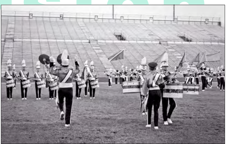
1970: Toronto Optimists (CNE)

Pictures from those years show happy smiling faces, not grim, serious ones. People happy with what they were into. When girls entered the picture, this was even