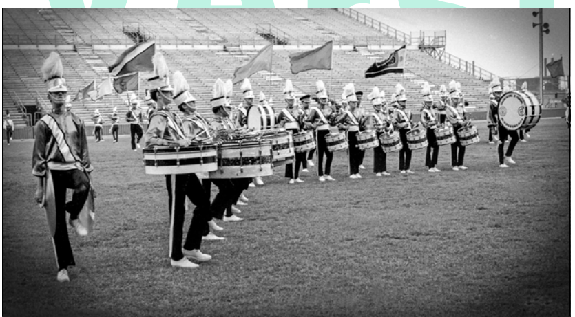
1970: Toronto Optimists

The 9th Annual Awards Dinner was held at the Knights of Columbus Hall in Scarborough. The