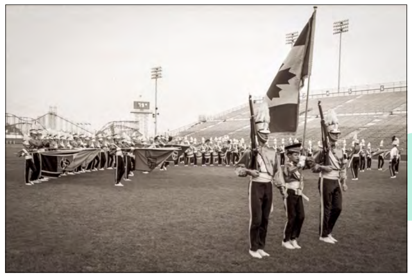
1970: Toronto Optimists (CNE)

The morning after the 1969 Canadian Junior Drum and Bugle Corps Championships, the world went on as usual. Outside of Canadian Drum Corps circles, some in the United States, and some media, the rest of the world was unaware that the Optimists were no longer Canadian Champions. This is not to diminish the efforts of all involved, but to help put it in proper perspective.