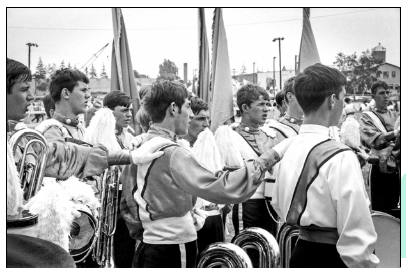
1970: Singing the corps song (Woodstock)

Drum lines had grown from a standard nine to as high as twenty-four. This figure was to