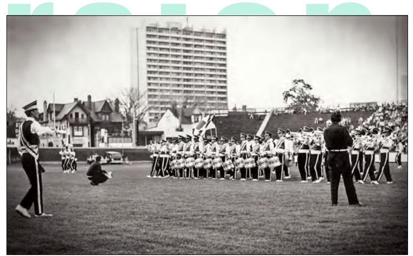
1970: La Salle Cadets (Varsity Stadium)

With this, the matter came to a close. It can aptly be summed up in a slightly altered version of an old adage – "All's fair in love and war and, it seems, Drum Corps".