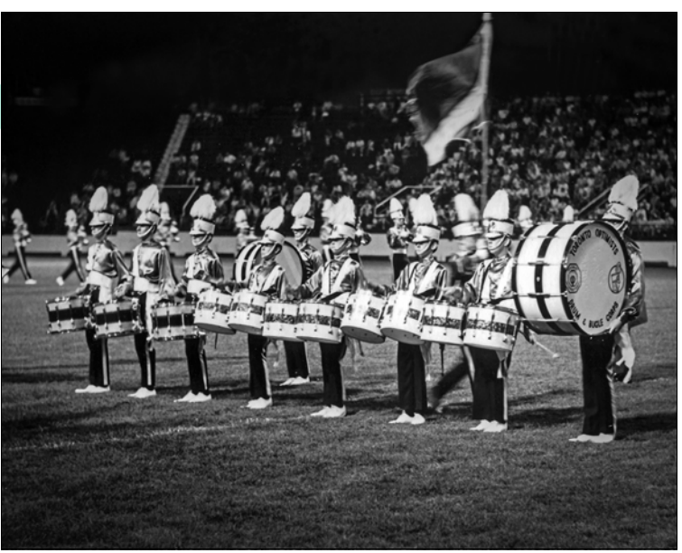
1970: Toronto Optimists

in Canada but in North America. It was still held in the CNE Stadium in Toronto, drawing crowds of many thousands. Here, this year, one of the major upsets took place. In fourth with a score of seventy-five, were the La Salle Cadets, who defeated De La Salle, in fifth place, by three points. Sixth, seven points back of La Salle, thereby, four behind De La Salle, were the Optimists. That La Salle was on top and the Optimists on the bottom, by a big margin, was the upset here. The top Americans, Racine Kilties, 27th Lancers, and St. Josephs had scores of 78, 76, 76, respectively, not that far ahead of