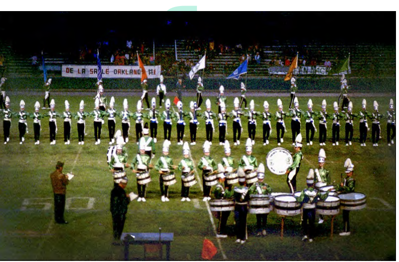
1970: Toronto Optimists (Nationals)

The goals that the Optimists had set were maybe a little too high, but in striving for them, they had achieved something. They were still in existence. They hadn't folded up. They weren't in the basement. They were still respectable. There was a good foundation on which to build, and again, aim for the top. They would always do this.