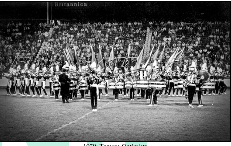
1970: Toronto Optimists

What had brought this decision to relinquish the reins, of course, was that the Corps had become a victim of its own success and longevity.